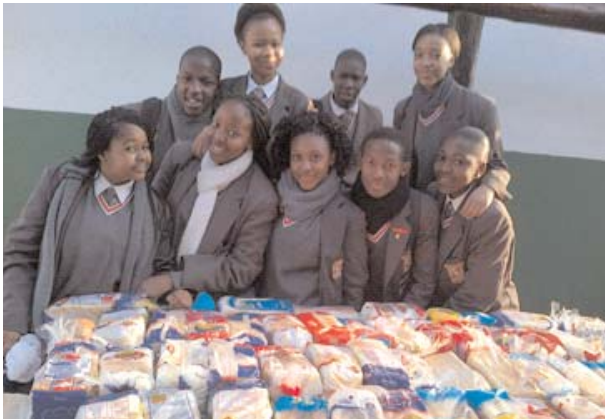
The bread was donated to the "We Care Foundation".

Gratitude is being expressed to all families who have contributed by donating a loaf of bread to charity on Mandela day. We set a target of 95 loaves of bread which was surpassed as 120 loaves of bread was donated. This implies that 120 families out of a possible 158 donated a loaf of bread.